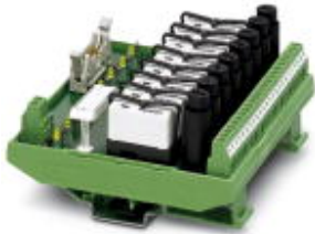
VARIOFACE output module, with 8 miniature relays, 1 PDT and fuse each, plugged, for 24 V DC (incl. relay)

Please be informed that the data shown in this PDF Document is generated from our Online Catalog. Please find the complete data in the user's documentation. Our General Terms of Use for Downloads are valid ( http://phoenixcontact.com/download )