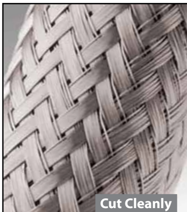
Cut Cleanly Shears